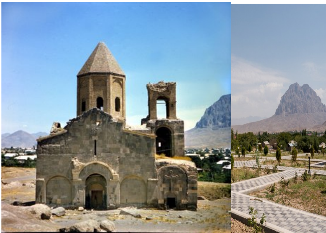
St. Surb Karapet (Holy Precursor Church) in Abrakunis, a major center of medieval Armenian theology