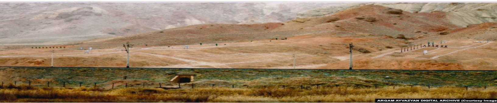
The destruction of the Armenian cemetery of Old Jugha in 2005