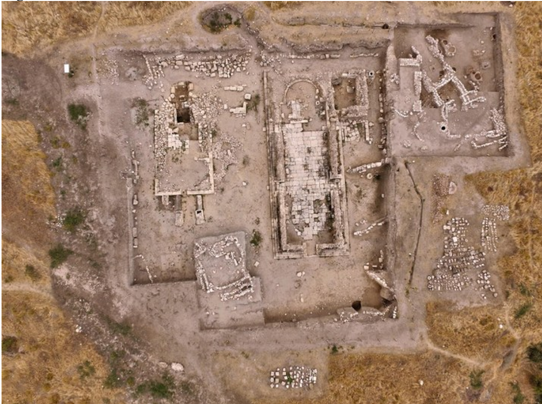
One of the sites being excavated at Tigranakert