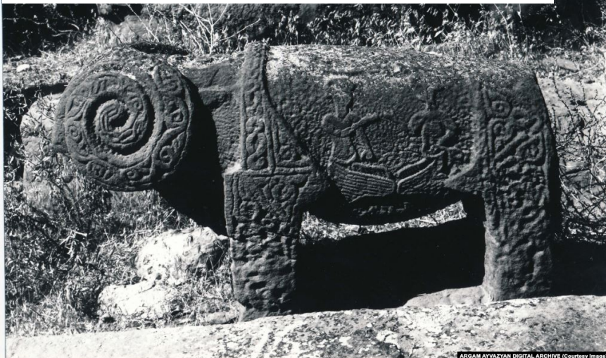
The Armenian cemetery of Old Jugha circa 1915