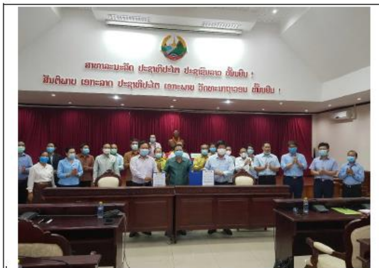
Photo: Signing ceremony for the final settlement amount for Compensation and Master Plan.