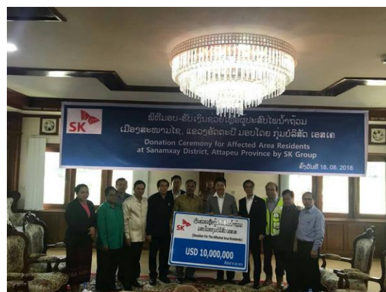
Photo: Handover of donations by SKEC.