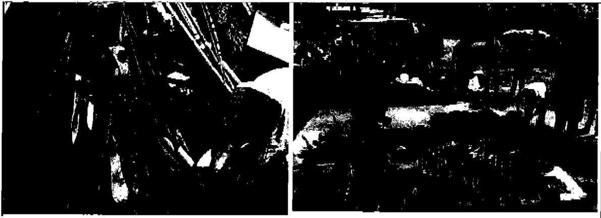
Some of the weapons and equipment recovered by Security Forces from Mumbere's palace in November 2016