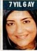
7 YIL 6 AY