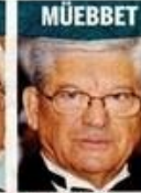
HURŞİT TOLAN Eski 1. Ordu Komutanı. Hükümeti çıkar ve güdükte ortadan kaldırmaya teşebbüs. Müebbet hapis cezası aldı.