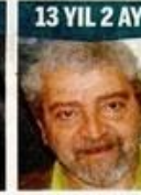
13 YIL 2 AY