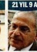
21 YIL 9 AY