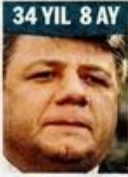
34 YIL 8 AY