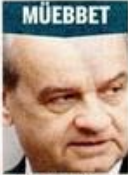
İLKER BAŞBUĞ Eski Genelkurmay Başkanı. Hükümeti çıkar ve güdükte ortadan kaldırmaya teşebbüsten müebbet aldı.