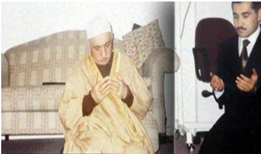
Adil Öksüz and Fetullah Gülen

Their images were captured by the security cameras at the Akıncılar air base.