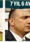
7 YIL 6 AY