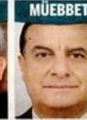
NUSRET TAŞDELER Emekli Orgeneral. Hükümeti çıkart ve güdükte ortadan kaldırmaya teşebbüs. Müebbet hapis cezası aldı.