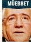
ŞENER ERUYGUR Eski Jandarma Komutanı. Darbeye teşebbüsten ağırlaştırılmış müebbet istendi. Müebbetle parçatıldı.