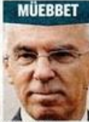
HASAN İŞSİZ Eski Genelkurmay 2. Başkanı. Hükümeti çıkar ve güdükte ortadan kaldırmaya teşebbüs. Ağırlaştırılmış müebbet aldı.